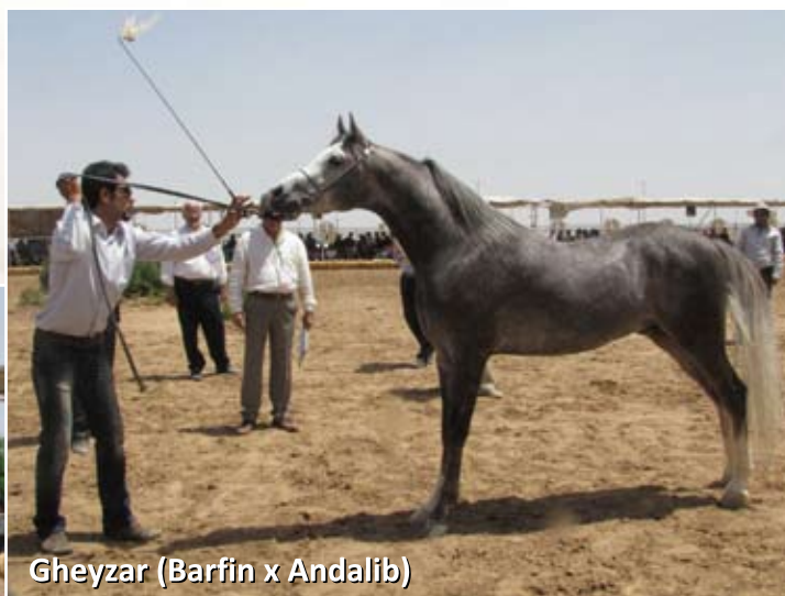
Gheyzar (Barfin x Andalib)