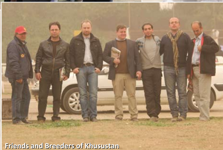
Friends and Breeders of Khusistan