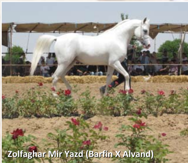
Zolfaghar Mir Yazd (Barfin X Alvand)