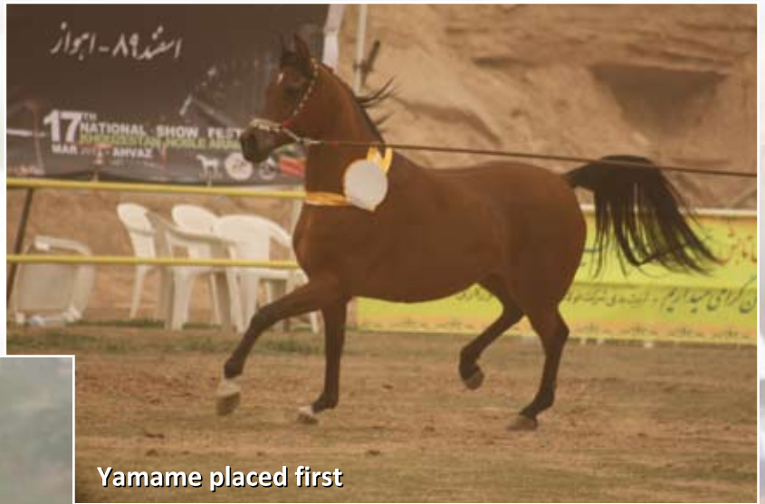
Yamame placed first