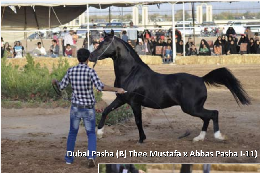
Dubai Pasha (Bj Thee Mustafa x Abbas Pasha I-11)