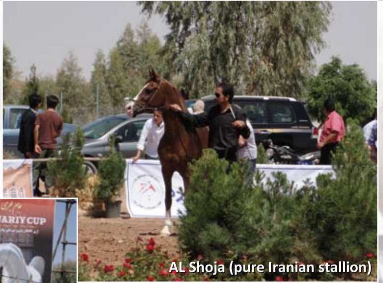
AL Shoja (pure Iranian stallion)