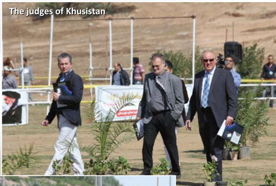
The judges of Khusistan