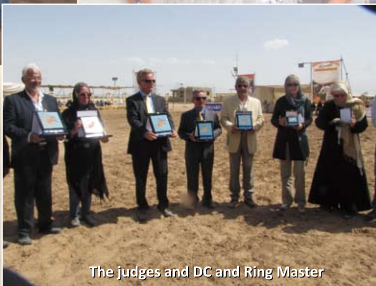
The judges and DC and Ring Master

lovers and breeders who are taking the opportunity to judge and appreciate the newly born foals from newly imported stallions.