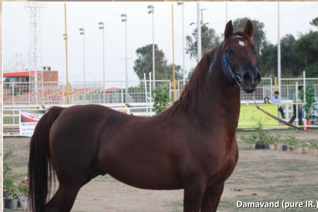
Damavand (pure IR.)