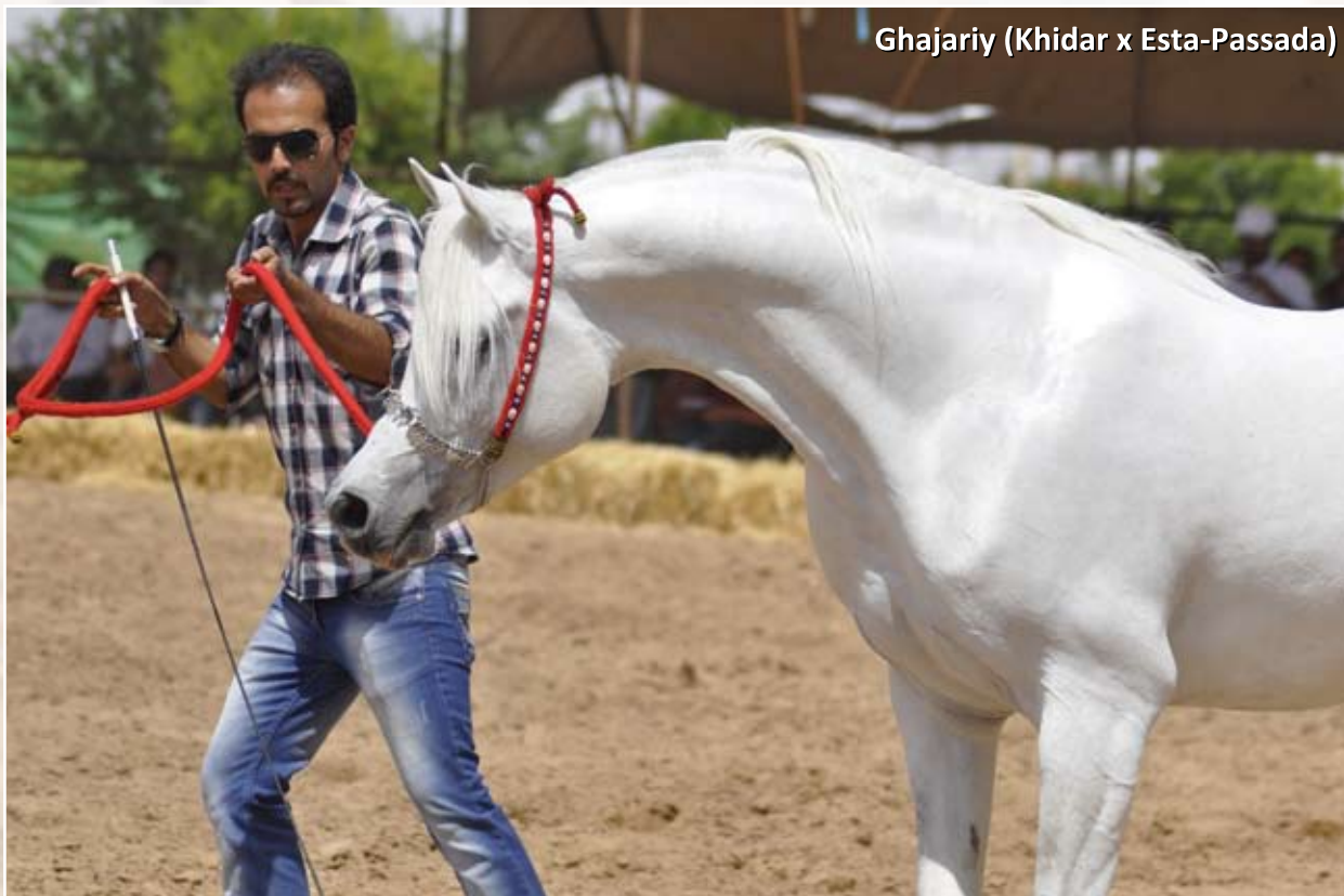
Ghajariy (Khidar x Esta-Passada)