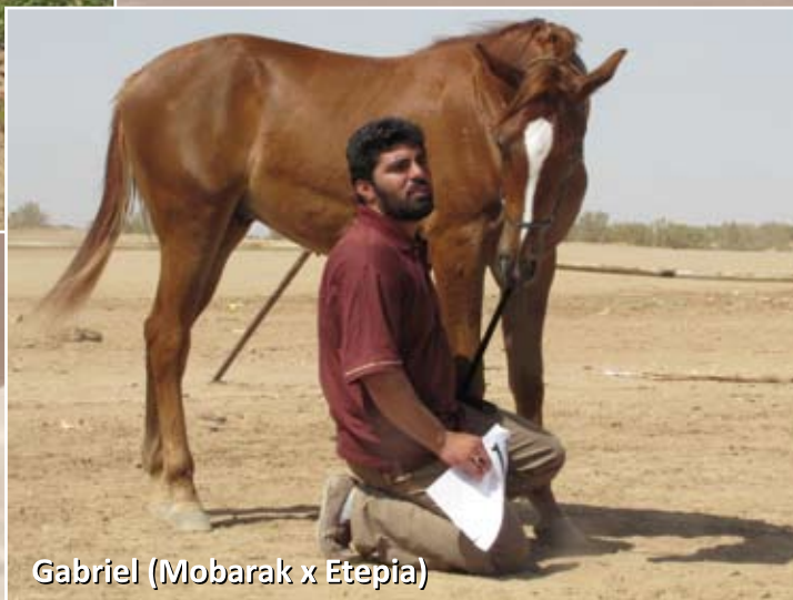
Gabriel (Mobarak x Etepia)

had already competed with each other in the past and many were curious to witness the outcome.