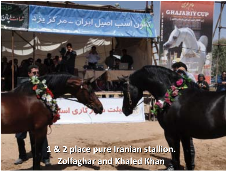
1 & 2 place pure Iranian stallion. Zolfaghar and Khaled Khan