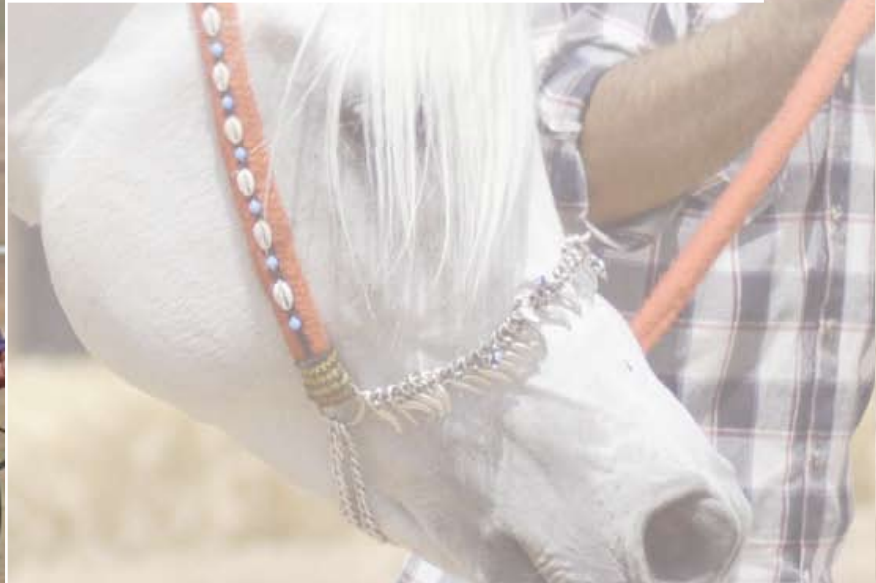
Serene Gassir Straight Egyptian bred in Italy