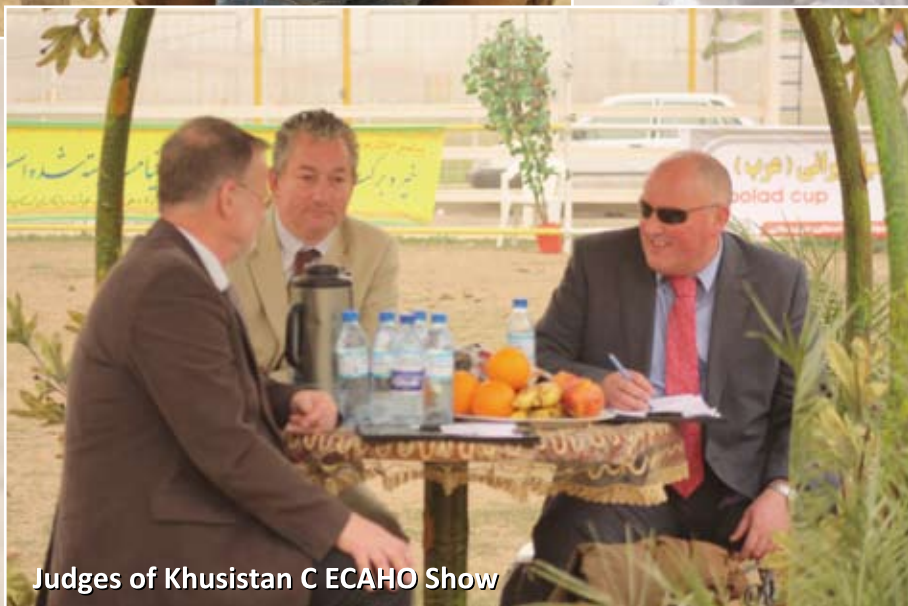
Judges of Khusistan C ECAHO Show