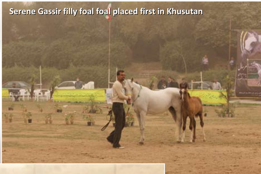
Serene Gassir filly foal placed first in Khusutan