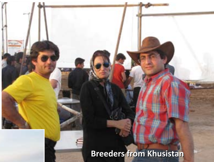
Breeders from Khusistan